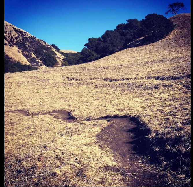
Goldfinch Trail, Crockett Hills