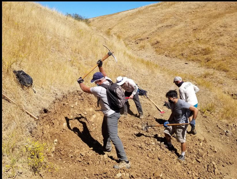
Almond Ranch trail work