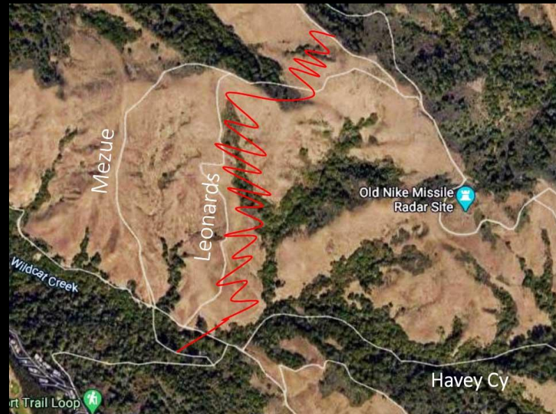
Potential flow trail in Wildcat Canyon (parallel to Havey Canyon)